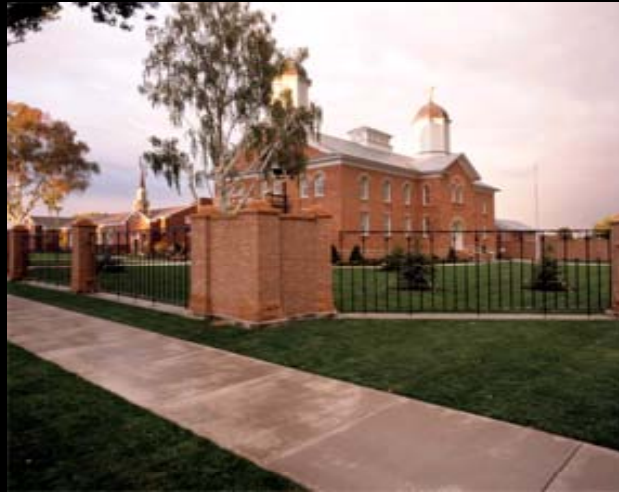
Churches, Temples, Commercial