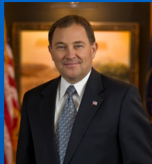
Governor Gary R. Herbert

"The 2010 Census is extremely important to Utah's future. A complete count of all Utahns impacts so many things, from our representation in Congress to the allocation of federal dollars for programs that benefit us in many ways. The responsibility of ensuring the most complete and accurate count in the 2010 Census lies with every Utahn."